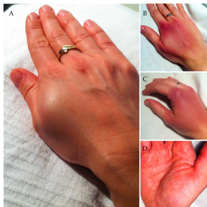
Figure 1 Haematoma in first webspace approximately 8 hours post-needling (A); bruising apparent 4 days later (B, C); haematoma visible in palm 10 days later (D).

Arterial injury from needling LI4 has been reported, 3 and in the same paper the distance to the nearest artery at LI4 was measured to be <10 mm in one fifth of a cohort of 20 subjects as part of a prospective MRI study. What is most interesting in the report by Wong and Hobara is the position of the thumb and first web space, which are perpendicular to the plane of the palm of the hand during imaging. The anatomical significance of this will be discussed and illustrated below.