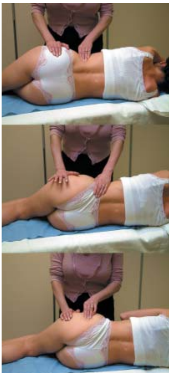
Figure 16 Side-lying 1: the upper image illustrates the position for examination of quadratus lumborum. Note that the upper knee is tucked in behind the lower knee, which fits the pelvis and increases the gap between the iliac crest and the 12th rib. In the middle image, the examiner is palpating the upper iliac crest and the greater trochanter prior to palpating across the fibres of the hip abductors (lower image).

flexed 90 degrees at the hip and fully adducted. This position puts the muscle on stretch and makes it easier to examine through the bulk of gluteus maximus (see Figure 17). It is also easier to needle in this position since an increase in resistance of needle insertion can generally be detected on reaching this muscle layer.