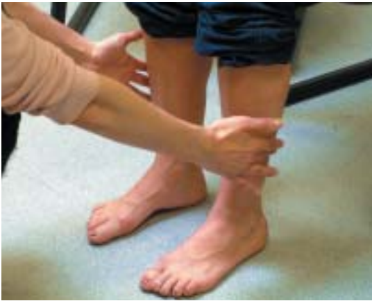
Figure 10 Testing sensation: one finger pad of each hand is run simultaneously over the same areas of both legs, and the patient is asked whether it feels the same on both sides. The outer aspect of the lower leg is the L5 dermatome, and the inner aspect is L4. The outer aspect of the foot is L5.

At this point the examiner may have decided to extend the assessment, and probably requires the patient to stand up. This is an opportunity to test quadriceps power (L3/4) by asking the patient to stand up from the chair using one leg only