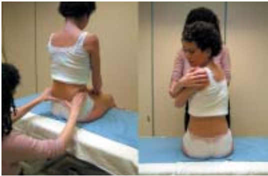
Figure 14 Sitting on an examination couch: this position can be used to assess the relative size of each hemipelvis (left image), which is relevant to an assessment of asymmetry. The right image illustrates an assessment of spinal rotation, which is much easier to perform with the patient seated on a couch.

If the practitioner wishes to assess spinal rotation, this is best performed in the sitting position (see lower image in Figure 14). The patient is asked to put their knees together and cross their arms over the front of their chest with a hand on each shoulder. The patient's knees are gripped by the thighs of the examiner and the patient's contralateral shoulder and elbow can be used to guide passive or active rotation.