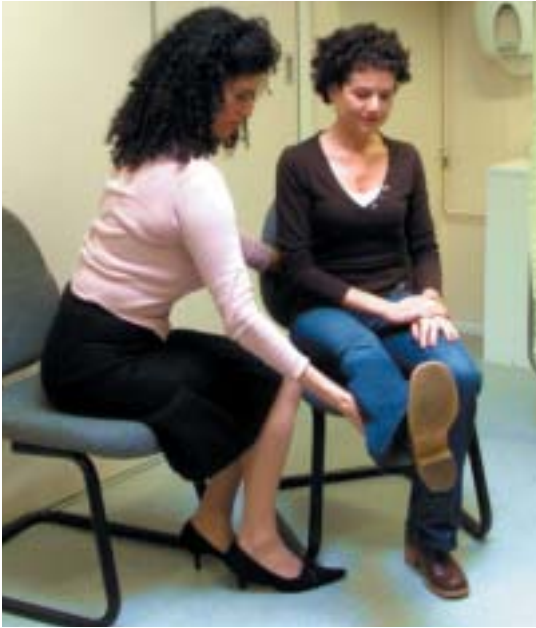
Figure 4 Seated SLR: with a hand maintaining the lumbar lordosis, the examiner asks the patient to straighten each leg individually, starting with the non-painful side. If the knee is straightened in this position the manoeuvre equates to a supine SLR of 90°.