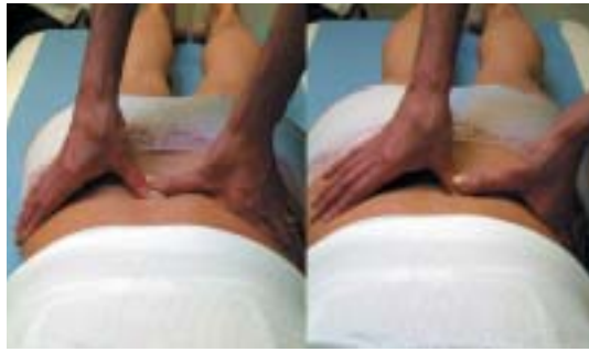
Figure 15 Lying prone: the left image illustrates how pressure can be applied to the lumbar spinous processes to assess posterior anterior movement and pain provocation. The right image illustrates palpation of deep paraspinal muscles. Constant firm pressure is applied, and the thumbs are moved in a cranial and lateral direction so as to cross the fibres of multifidus.

The prone position is suitable for palpating the spinous processes and deep paraspinal muscles (see Figure 15). The muscles of the hand and wrist are not strong enough to assess posterior anterior movement of the lumbar spinous processes, so the weight of the upper body is used through straight arms and fixed thumbs (see left diagram of Figure 15). Pressure is applied to each spinous process in