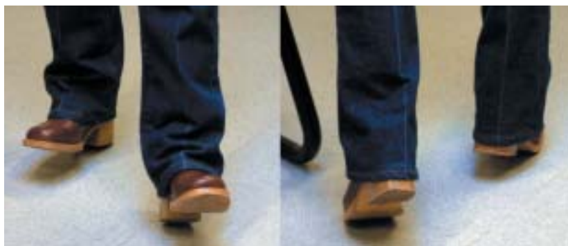
Figure 1 Heel walking (left image): this requires strong contraction of tibialis anterior (L4/5), and to a lesser extent, extensor digitorum longus and extensor hallucis longus (L5/S1). Toe walking (right image): this requires strong contraction of gastrocnemius and soleus (S1/2).