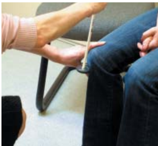
Figure 7 Knee jerk: in this figure the examiner's left hand is placed on the top of the knee, and the thumb of the same hand feels for the patella tendon. This position allows the examiner to both target the tendon accurately, and to relax the patient's leg by gently shaking the knee from side to side.