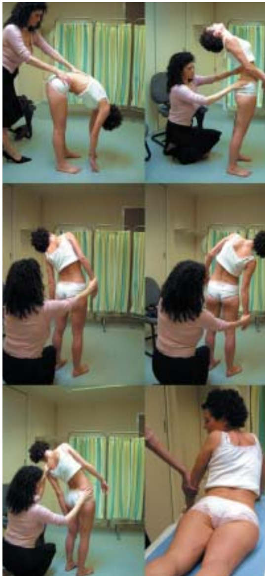
Figure 12 Lumbar spine movements (standing): these include flexion and extension (upper images); note the placement of the examiner's hands), lateral flexion (middle images), and a combination movement of lateral flexion with extension and ipsilateral rotation in two different positions (lower images) to load or compress the ipsilateral lumbar zygapophyseal joints.

Observing the patient from the back the practitioner can note any postural asymmetries (see Figure 11). The relative heights of the upper iliac crests are noted, and any difference can be compared with the same assessment of the heights of the greater trochanters. These measures will give an indication of any gross leg length inequality and possibly pelvic torsion. The relative heights of the upper iliac crests can also be compared with the relative heights of the acromioclavicular joints. If both iliac crests and acromioclavicular joints (ACJ) are level, the spine is likely to be straight (in the coronal plane). If both slope the same way (eg both the left iliac crest and left ACJ are lowered), the spine is likely to form an S-shape. If the slopes are opposite (eg the left iliac crest is low but the left ACJ is high), the spine is likely to form a C-shape. The shape can be confirmed by direct observation and palpation of the whole spine. The relevance of such asymmetries may help the practitioner in assessing the loading of spinal elements, and in identifying the likely areas to examine the paraspinal muscles for shortening. Lumbar zygapophyseal joints (ZAJ) are likely to undergo more mechanical loading on the concave side of a lateral spinal curve, and the long paraspinal muscles are allowed a greater degree of shortening on the concave side, and therefore may be more prone to developing TrPs.