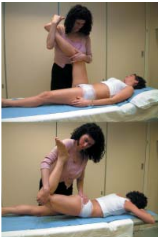
Figure 19 Nerve tension tests for the lower extremity: the upper image illustrates the position used for performing the bowstring test with the patient lying. The lower image illustrates the femoral stretch test.

LBP out of 520 seen by the author between 1993 and 1998. Data included: diagnostic category, the presence of tender points (TePs) and outcome. Outcomes were determined by the author based on either absolute change ('excellent' = cure or complete relief of symptoms; 'nil' = no change) or patient behaviour ('good' = symptom relief or control and patient does not seek other treatment; 'fair' = some symptom relief, but patient seeks other treatment for the complaint). 'Excellent' or 'good' outcomes were considered successful.