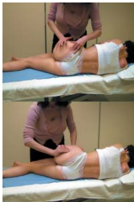
Figure 17 Side-lying 2: this is the best position for examining piriformis, with the upper leg flexed at 90° at the hip and the thigh fully adducted. In the upper image the examiner is palpating the greater trochanter and the sciatic notch. Pressure can be applied to the more medial portion of piriformis in the sciatic notch. The lower image illustrates palpation across the fibres of piriformis more laterally. Piriformis is palpated through gluteus maximus, and is felt as a step up when palpating in a cranial direction.

flexed 90 degrees at the hip and fully adducted. This position puts the muscle on stretch and makes it easier to examine through the bulk of gluteus maximus (see Figure 17). It is also easier to needle in this position since an increase in resistance of needle insertion can generally be detected on reaching this muscle layer.