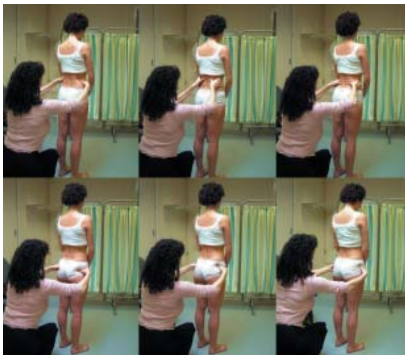
Figure 13 Screening for tender and trigger points (standing): the images illustrate palpation of quadratus lumborum (upper left image), erector spinae (upper middle and right images), piriformis (lower left image), posterior fibres of gluteus medius (lower middle image), and middle fibres of gluteus medius and minimis (lower right image).

S1 during flexion and extension, to assess the range of lumbar movement more easily. The practitioner does not have to be absolutely accurate in finding the spinous processes of L1 and S1, but it is worth briefly palpating the posterior superior iliac spine (PSIS) to find S1 (upper border of PSIS), and palpating the 12th rib just lateral to the bulk of erector spinae to estimate the level of L1. Flexion increases the pressure in the intervertebral discs, and stretches the paraspinal muscles: extension loads the posterior columns and ZAJs, and relaxes the paraspinal muscles. Lateral flexion (see middle images of Figure 12) loads the discs and ipsilateral posterior column and ZAJs, and stretches the contralateral musculature. If pain is provoked by any of these movements, the examiner confirms the location (central, ipsilateral, contralateral) and nature of the pain, including whether the pain is recognised as the patient's pain complaint. Firm conclusions cannot be drawn from these provocation tests; however, the information may help support or refute tentative ideas about the origin of the patient's pain.